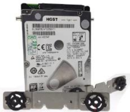
Industrial rubber brackets

Industrial rubber bracket to prevent the collision of hard disk in the process of driving, to protect the data security of hard disk. Exclusive damping technology to build military grade quality.